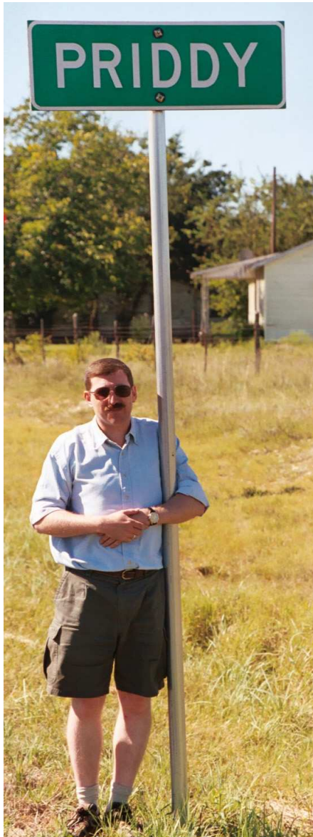
Priddy, Datchet reaches Priddy, Texas

My next attempt at running was 3 days later. We'd spent another day in New Orleans and then driven along the Louisiana coastline through Bayou country to Texas (much of what we drove through was flooded a week later by the Hurricane Ivan storm surge, and again by Hurricane Katrina last year). We turned north near Houston and ended up in a small town near Waco called Hamilton, where the only hotel was owned by a gentleman who proceeded to tell me about all his children who lived in England and about how many houses he owned in London – we were practically related by the time he'd finished. I woke early and discovered that it was actually quite cool outside – perfect for a morning run. Sadly after a couple of miles something triggered an asthma attack and of course I'd forgotten to pick up my inhaler on the way out. I wheezed back to the hotel but that was it for running that day.