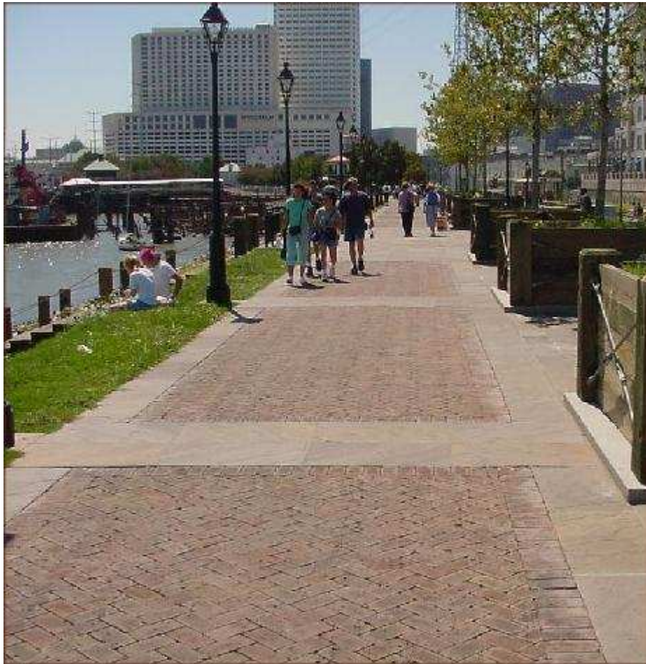
New Orleans Moonwalk

The second morning in New Orleans I decided it was time for a run. On the map I'd found a route along the Mississippi that looked like it gave me an 8 mile round trip of clear running, so I was up at 6am to try and beat the heat. I soon discovered however that you don't beat the heat in New Orleans. Even at that time in the morning it was in the 80's and the humidity just made it worse. It was lovely running the Moonwalk alongside the Mississippi as the sun rose, past the silent paddle steamers and a few attendees of the gay festival sleeping it off on the benches, but within a few minutes I was already overheating.