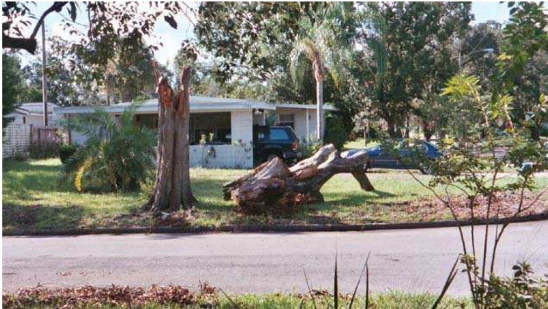
A tree destroyed by the hurricane – the rest of it was 50 yards down the road!

The first thing we were told on landing in Orlando was that we should leave immediately because Hurricane Frances was on the way. Having seen the results of the previous week's Hurricane Charley as we flew in to the airport we weren't going to argue. There's nothing like the sight of houses reduced to piles of firewood and hundreds of fallen trees to bring home the fact that you don't want to be there during a hurricane.