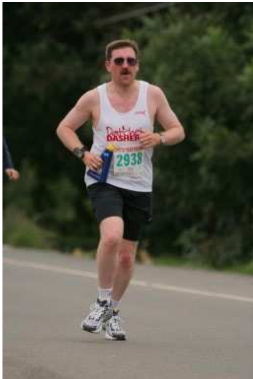
Why do I never look like a proper runner?

Outside the funnel area I collected my goodie bag and then there were all sorts of freebies for the runners – Chevy's Mexican food, Starbucks coffee, Sobe fruit juices, all sorts of fruit including deliciously cool watermelon slices (excellent after a run!) and a bunch of other business stuff I was too knackered to walk down to. All in all it was a well-run event and very enjoyable.